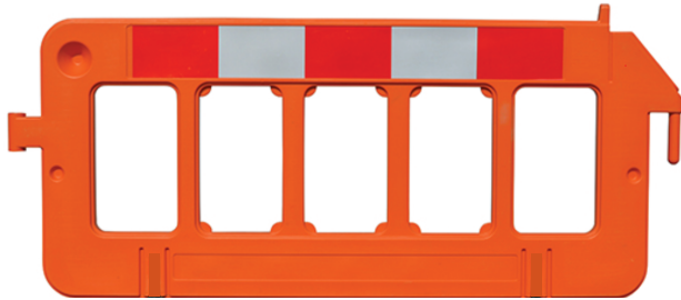
1 Barrier Panel